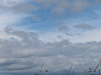
Claude Monet couldn't do better!