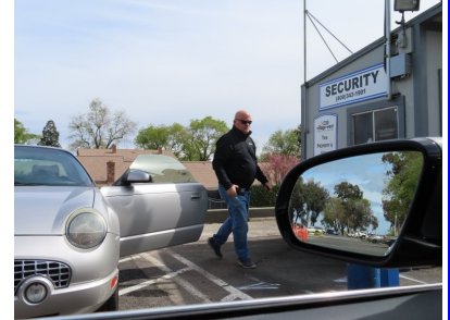
T-Bird Stone at the gate.

We were greeted by a Pizza buffet, three to choose from. Fresh green salad justified the stuffing by Pizza.