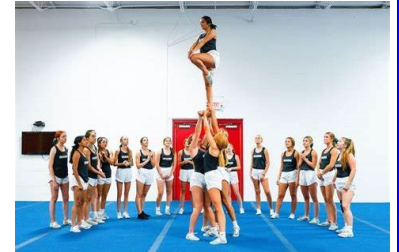
Creating nervous parents!